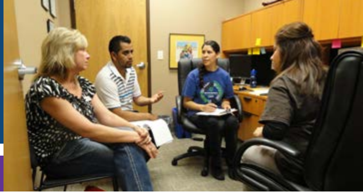
Promise Community Health Center, Iowa