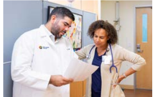
San Ysidro Health, California

While only 15% of all residents enter primary care practice, 2 65% of THCGME graduates are currently practicing in a primary care setting. 6