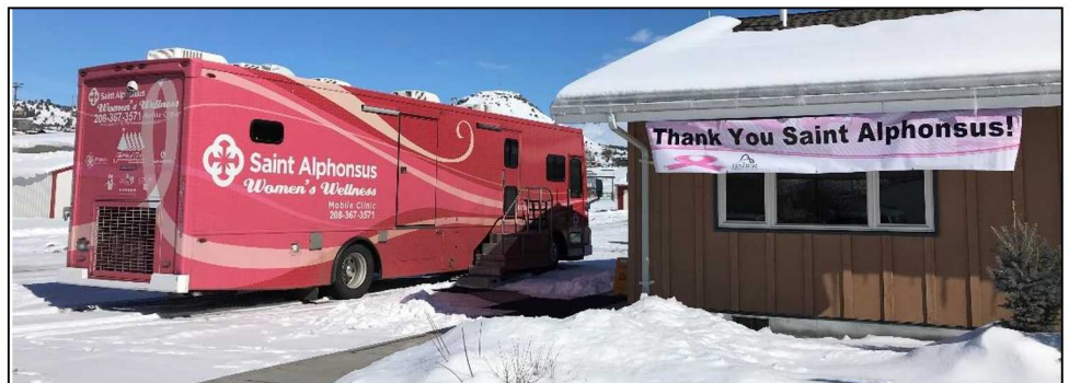
Bringing higher level screening and care to our patients, right where they live. (March 2019)