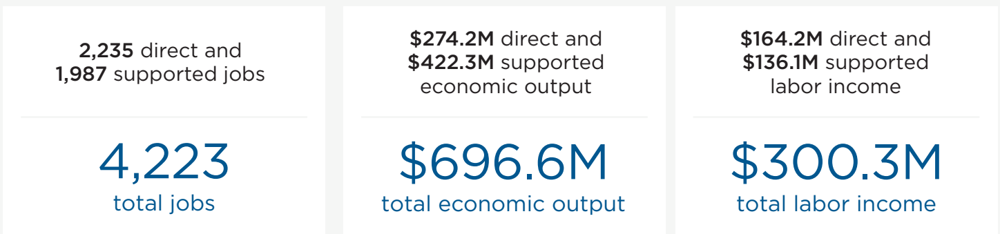
FIGURE 2. Economic Impact of Community Health Centers in Arkansas

Note: Totals may differ from sum of numbers due to rounding.