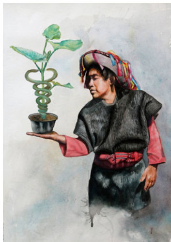
Sacred pepper, 2020, watercolor on cotton paper

Come join us for the artwork unveiling and presentation of scholarships during the Migrant Health Awards and Networking Luncheon. ■