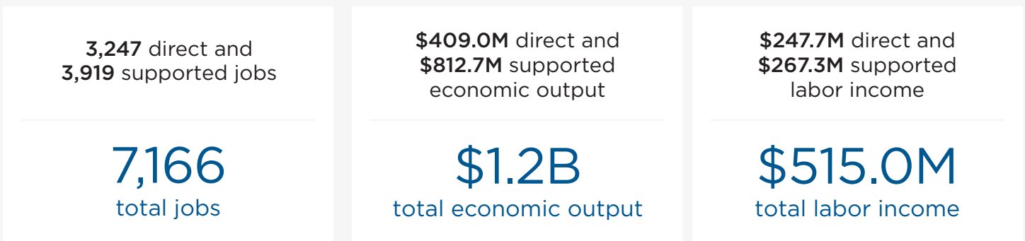
FIGURE 2. Economic Impact of Community Health Centers in Tennessee

Note: Totals may differ from sum of numbers due to rounding.