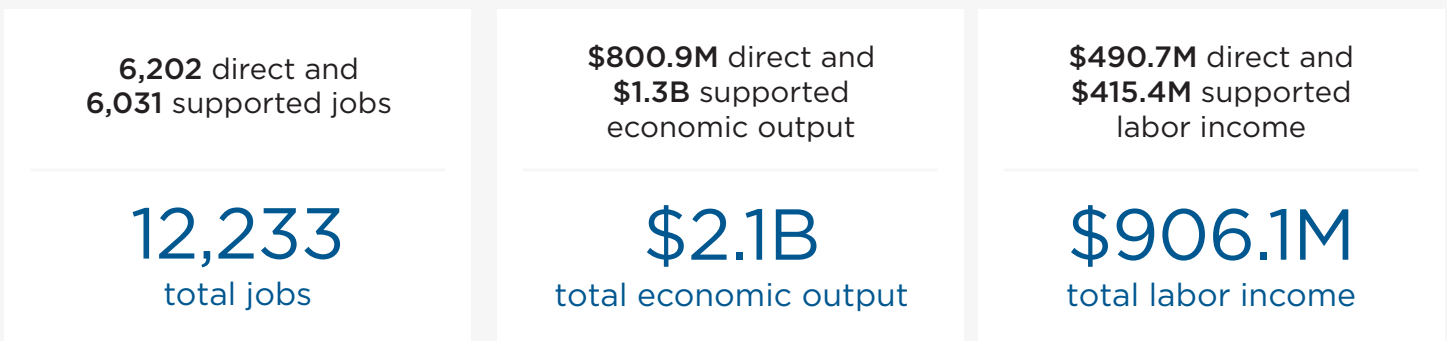
FIGURE 2. Economic Impact of Community Health Centers in Michigan

Note: Totals may differ from sum of numbers due to rounding.