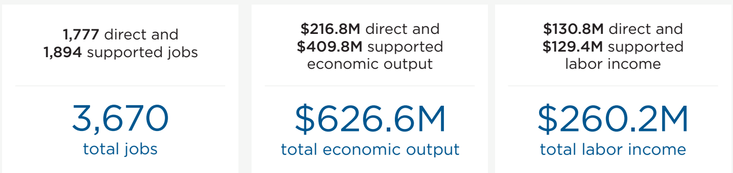
FIGURE 2. Economic Impact of Community Health Centers in Iowa

Note: Totals may differ from sum of numbers due to rounding.